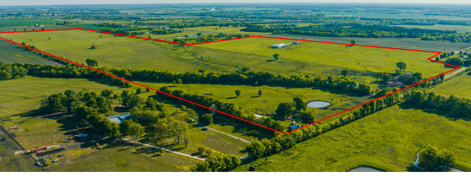
Property Location: 6738 Hwy 24, Paris TX 75462 | Listing Price: $1,750,000