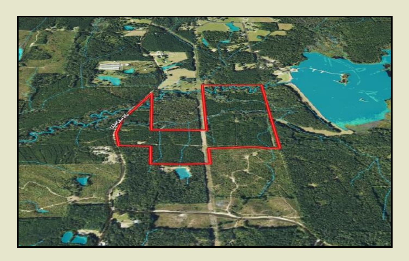
All information contained herein is supplied by sources deemed reliable, but is not guaranteed by Sartain's Heritage Properties, its Brokers or Agents. Properties are subject to errors, omissions, correction, price change, prior sale or withdrawal without notice. All Buyer's agents are required be identified on the first contact with Broker/Agents of Sartain's Heritage Properties and must accompany the buyer on showings to receive full fee participation. Otherwise, the fee participation shall be at the sole discretion of the Broker and Sartain's Heritage Properties.