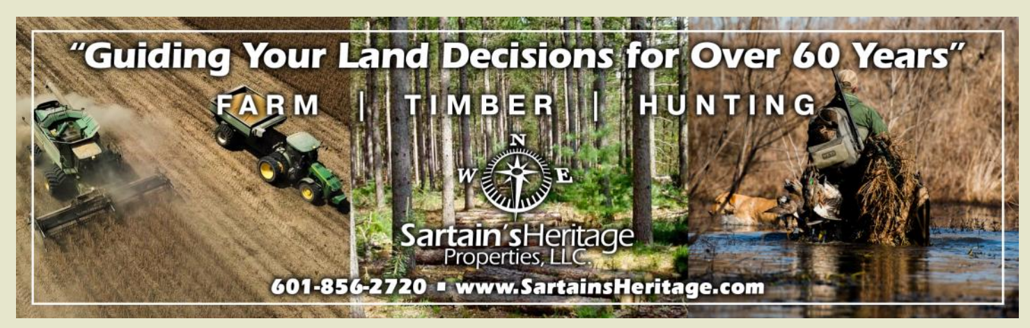
All information contained herein is supplied by sources deemed reliable, but is not guaranteed by Sartain's Heritage Properties, its Brokers or Agents. Properties are subject to errors, omissions, correction, price change, prior sale or withdrawal without notice. All Buyer's agents are required be identified on the first contact with Broker/Agents of Sartain's Heritage Properties and must accompany the buyer on showings to receive full fee participation. Otherwise, the fee participation shall be at the sole discretion of the Broker and Sartain's Heritage Properties.