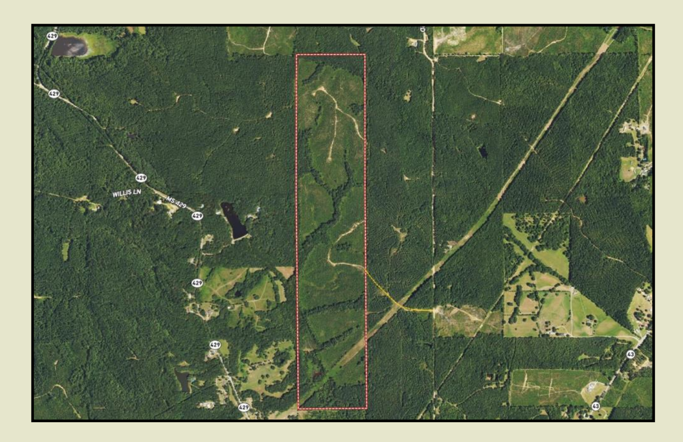
Thomastown - 208.52 acres

Located in Leake County, Mississippi, near Thomastown. The property spans 208.52 acres and features a variety of timber types and natural features. Approximately 143 acres are planted with five-year-old pine trees, while another 16 acres boast thirty six-year-old pines.