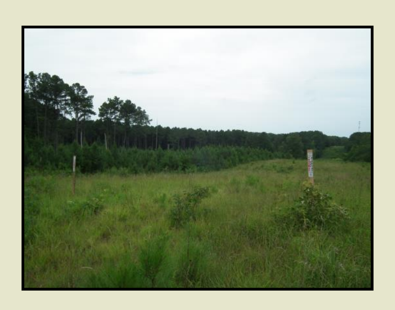
All information contained herein is supplied by sources deemed reliable, but is not guaranteed by Sartain's Heritage Properties, its Brokers or Agents. Properties are subject to errors, omissions, correction, price change, prior sale or withdrawal without notice. All Buyer's agents are required be identified on the first contact with Broker/Agents of Sartain's Heritage Properties and must accompany the buyer on showings to receive full fee participation. Otherwise, the fee participation shall be at the sole discretion of the Broker and Sartain's Heritage Properties.