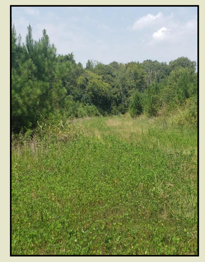
All information contained herein is supplied by sources deemed reliable, but is not guaranteed by Sartain's Heritage Properties, its Brokers or Agents. Properties are subject to errors, omissions, correction, price change, prior sale or withdrawal without notice. All Buyer's agents are required be identified on the first contact with Broker/Agents of Sartain's Heritage Properties and must accompany the buyer on showings to receive full fee participation. Otherwise, the fee participation shall be at the sole discretion of the Broker and Sartain's Heritage Properties.