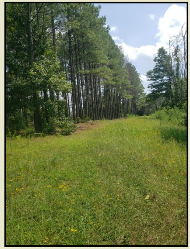
All information contained herein is supplied by sources deemed reliable, but is not guaranteed by Sartain's Heritage Properties, its Brokers or Agents. Properties are subject to errors, omissions, correction, price change, prior sale or withdrawal without notice. All Buyer's agents are required be identified on the first contact with Broker/Agents of Sartain's Heritage Properties and must accompany the buyer on showings to receive full fee participation. Otherwise, the fee participation shall be at the sole discretion of the Broker and Sartain's Heritage Properties.