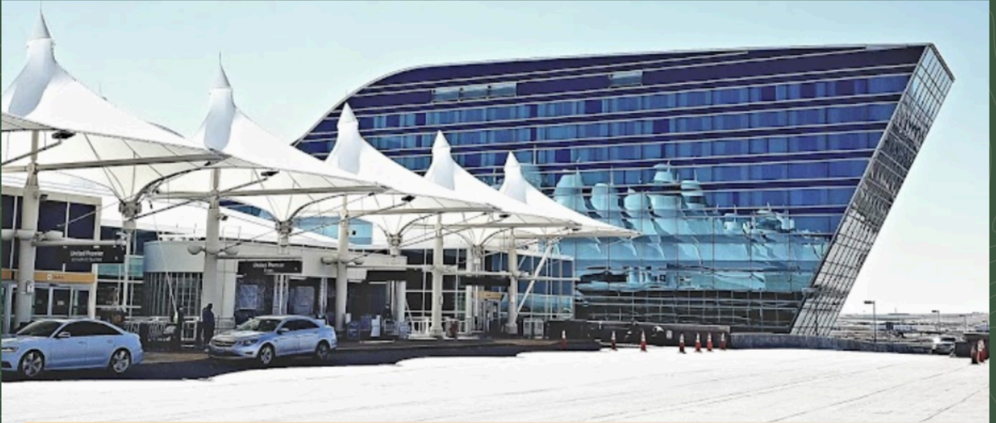
Denver International Airport