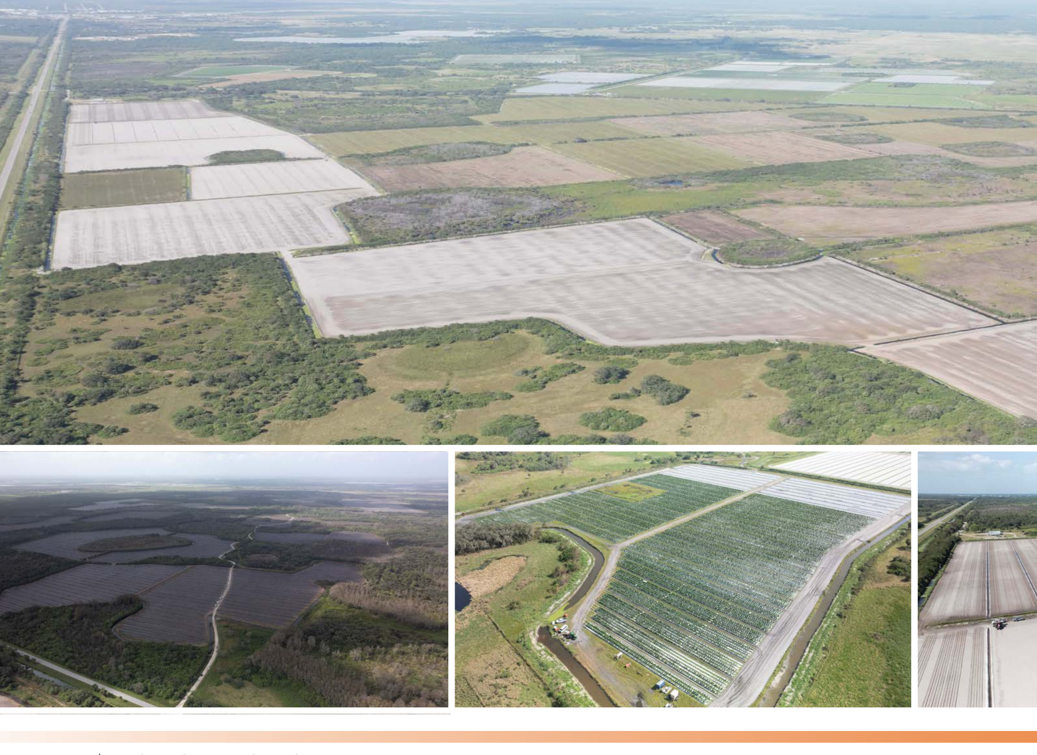
2 • SVN | Saunders Ralston Dantzler Real Estate