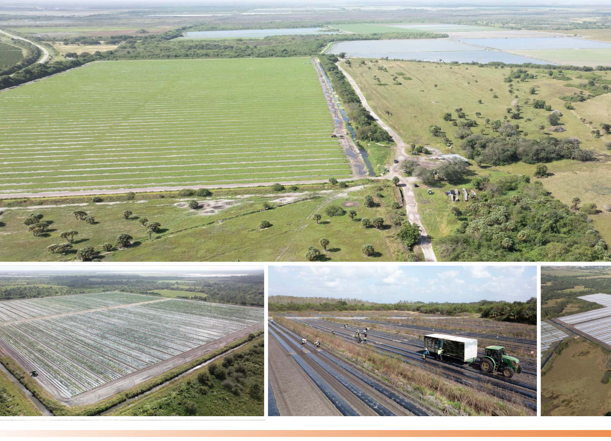
10 • SVN | Saunders Ralston Dantzler Real Estate