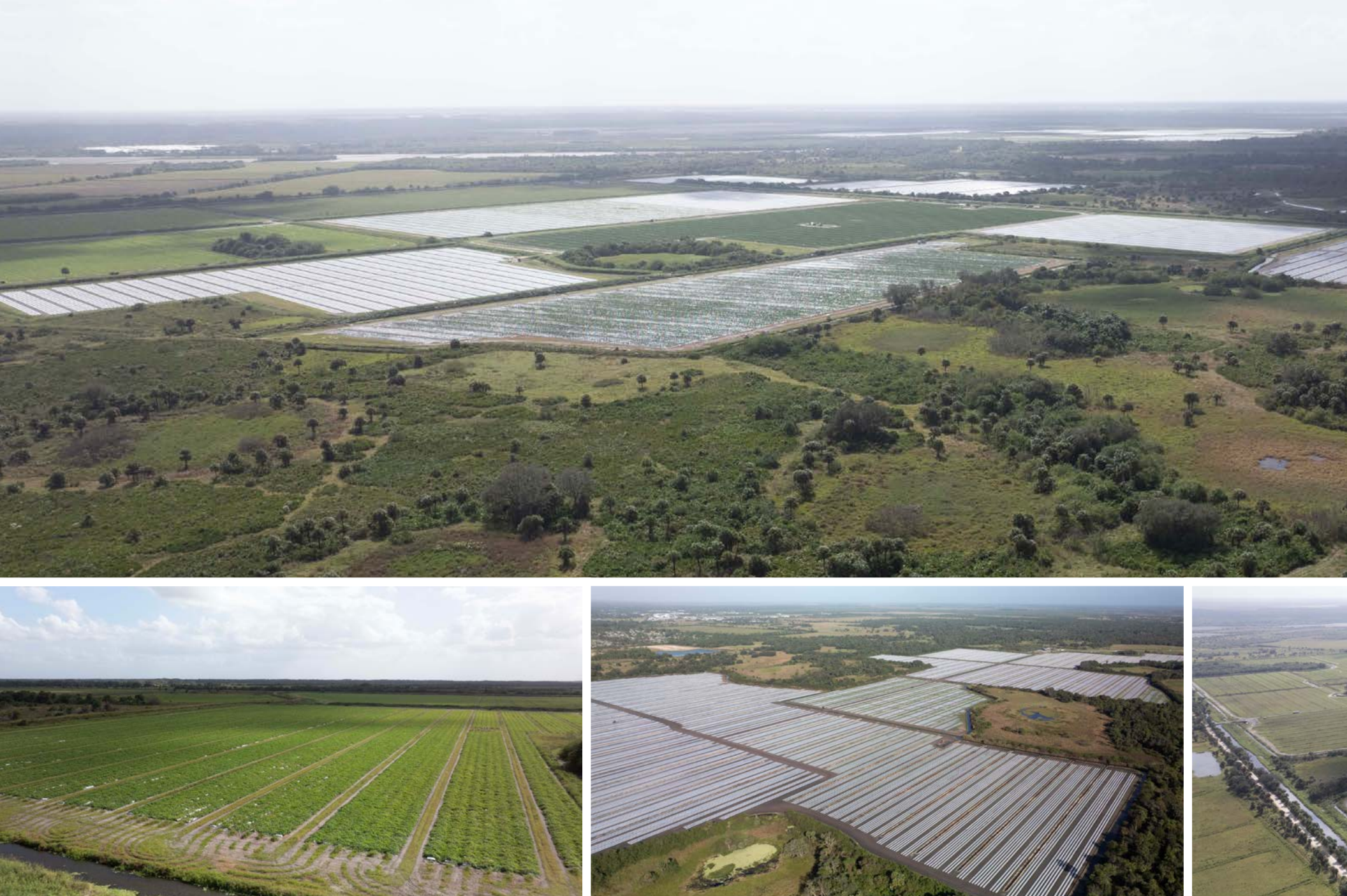
6 • SVN | Saunders Ralston Dantzler Real Estate