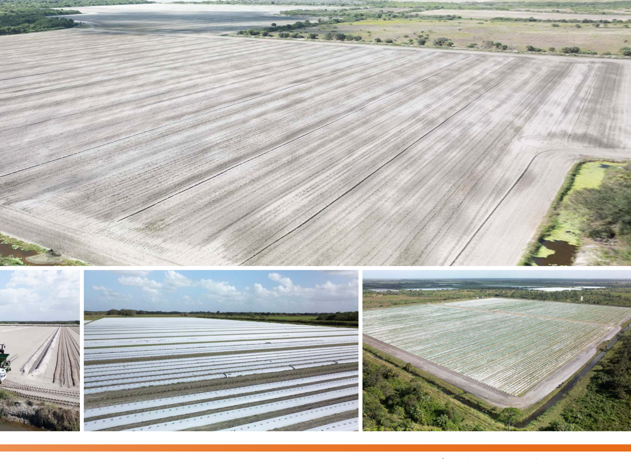
SVN | Saunders Ralston Dantzler Real Estate • 9