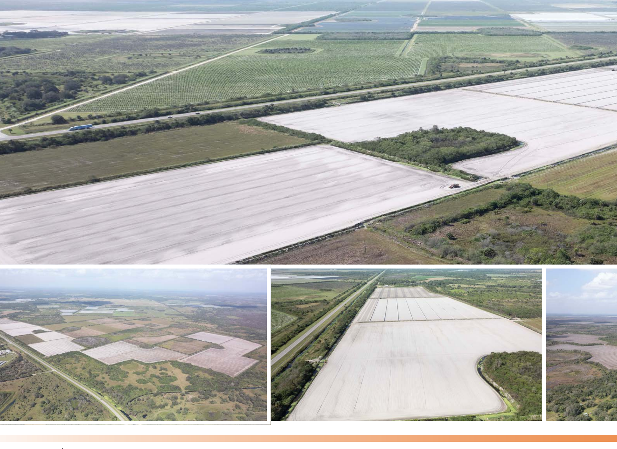
18 • SVN | Saunders Ralston Dantzler Real Estate