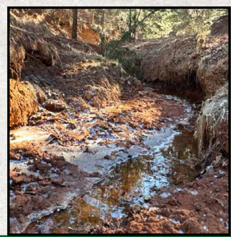
Live Spring • Excellent Hunting Habitat