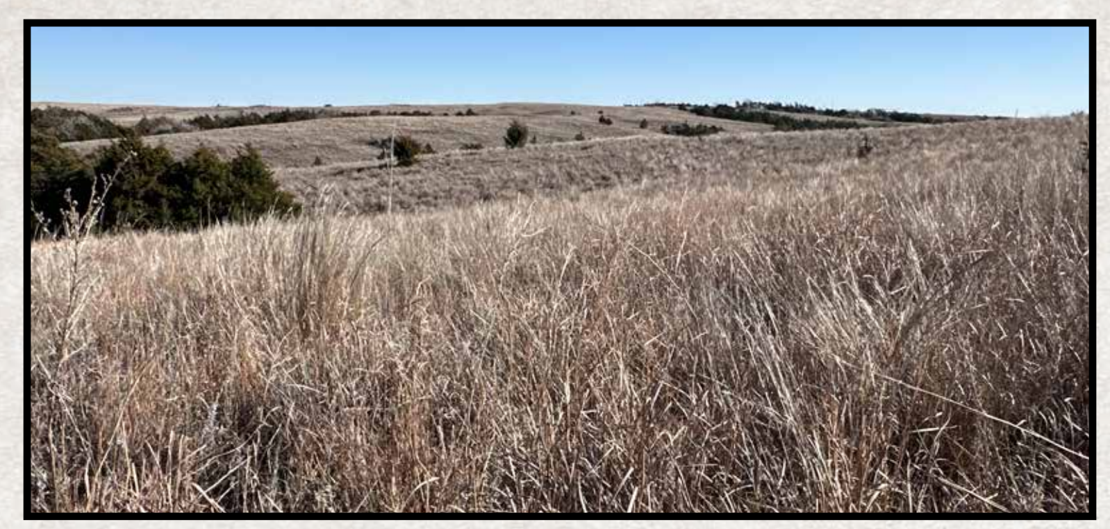
This 236 +/- acre property is located just northwest of Thomas, with good access from Putnam and Thomas. It includes a mix of native and improved grasses, making it great for livestock production. The property has good perimeter fences and previously farmed areas have been converted back to grass for grazing or haying. There is a seasonal pond along with a live creek on the property that feeds into a half-acre pond providing water for livestock and wildlife. The property's proximity to the Canadian River and areas of light timber creates a good habitat for wildlife, offering potential for recreational use or a remote homesite.