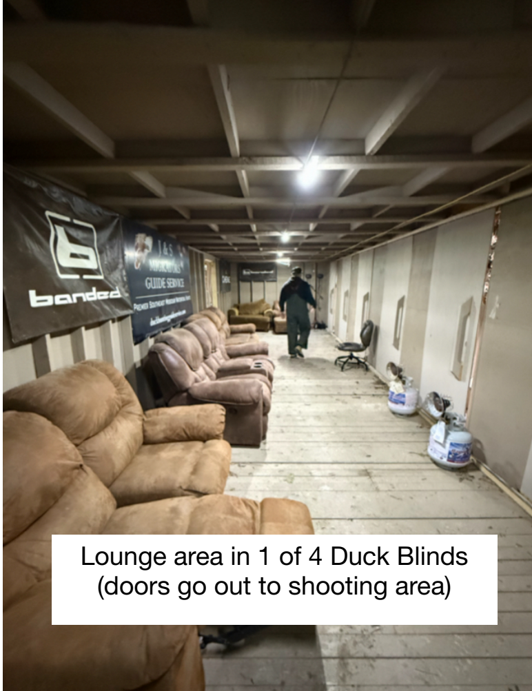
Lounge area in 1 of 4 Duck Blinds (doors go out to shooting area)