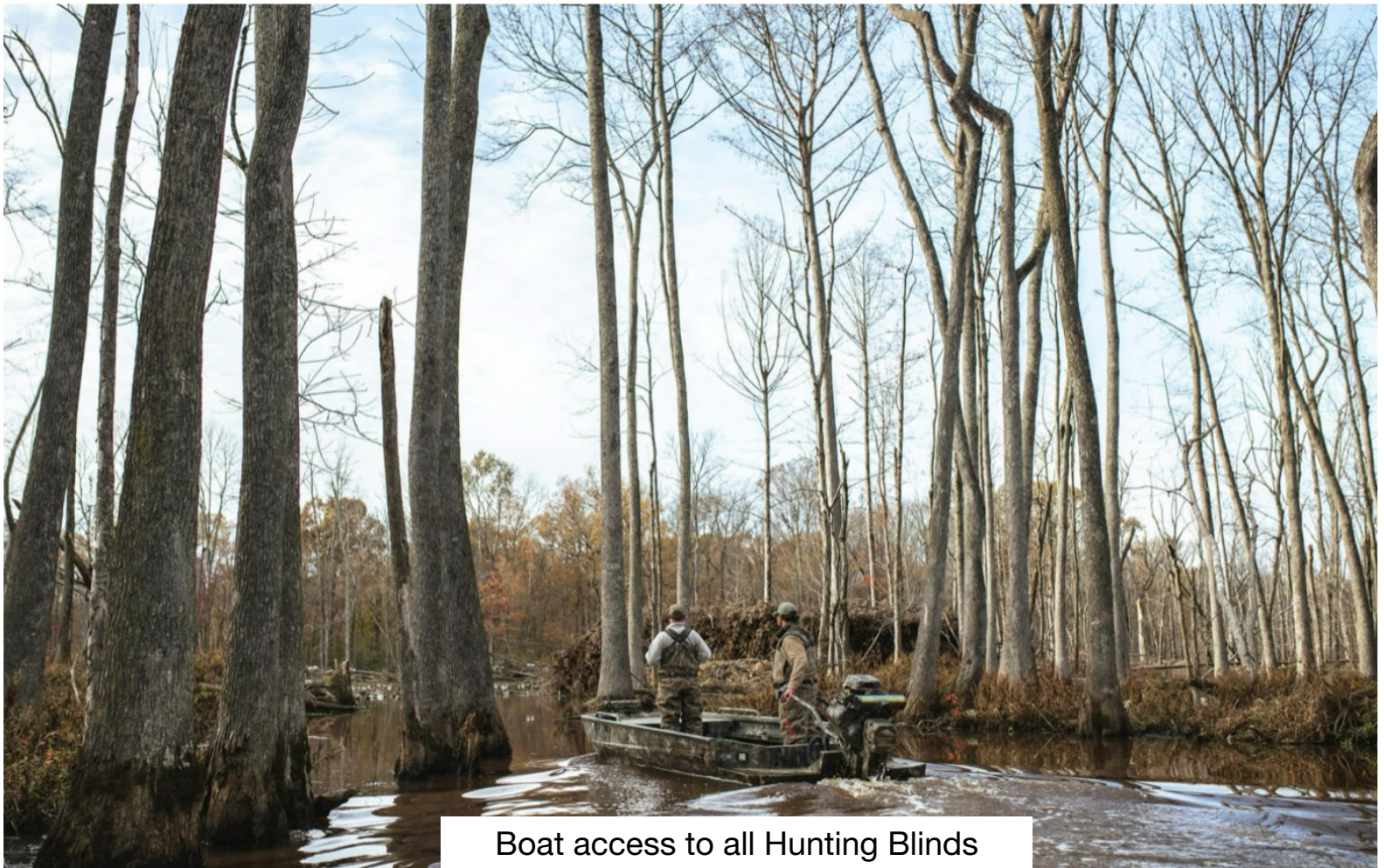
Boat access to all Hunting Blinds